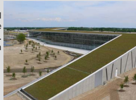
Haworth global headquarters Holland, Michigan

By utilizing a broad array of sustainable materials and technology, West Michigan projects have embraced the use of green roofs. Recent projects include the Metro Health Hospital building and Haworth's headquarters. When you add Ford's River Rouge plant on the east side of the state into the mix, Michigan has a significant number of the largest modular green roof installations in North America.